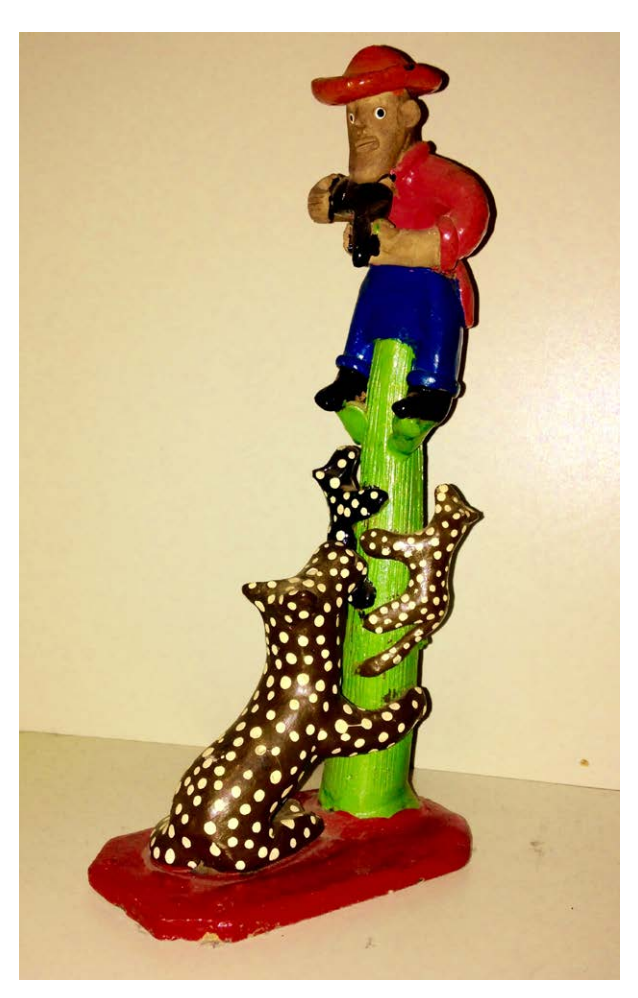
You wouldn't look too thrilled either if you were straddling a cactus and had backward-Dalmatians coming after you. This week's second prize.

"Pope's momma so fat they give her a poker chip instead of a Communion wafer."